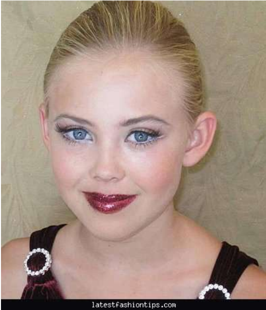
EXAMPLE MAKE-UP Dancers 6yrs and older

Female Dancers Ages 6+ should have a heavier make-up application. This should consist of brown/neutral eye shadow, eye liner, blush, mascara and red or darker pink/wine lipstick.