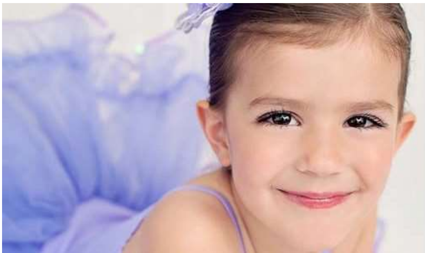
EXAMPLE MAKE-UP Dancers 5yrs and under

Female Dancers Ages 5 & Under: Should minimally have on blush, mascara and bright pink lipstick.