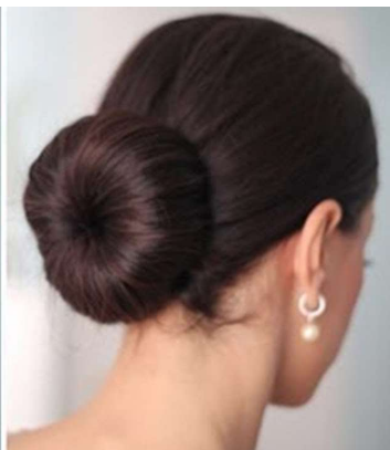
Low Bun at Nape of Neck